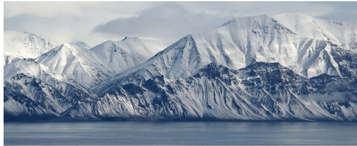
Coastal mountains, TINMCA