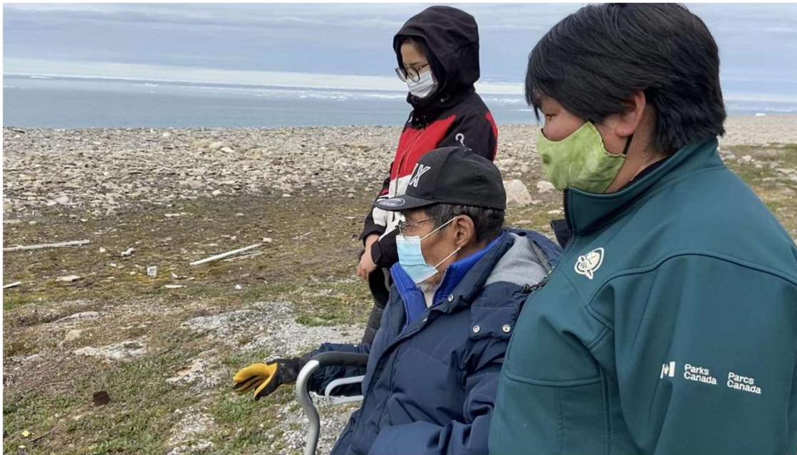
Elder with student and staff, TINMCA